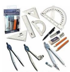
Mr.Pen 15 Pcs Compass Set with Swing Arm Protractor (6"), Geometry Set, Divider, Set Squares, Ruler, Protractor, Compass, and Eraser