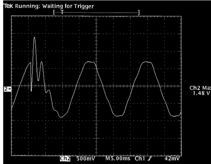
TYPICAL LOW FREQUENCY DECAYING RINGWAVE